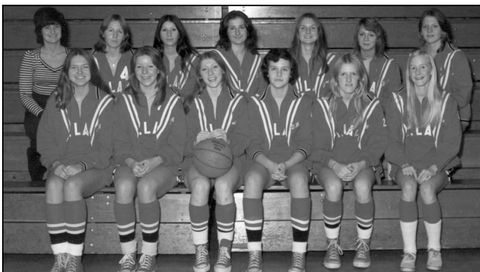
HAMTRAMCK ST. LADISLAUS 1974

St. Ladislaus extended its winning streak to 42 straight (including regular-season victories over both Class A finalists, Detroit Dominican and Farmington Our Lady of Mercy) and earned its second consecutive Class C crown with a 59-45