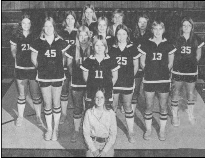
EWEN-TROUT CREEK 1973