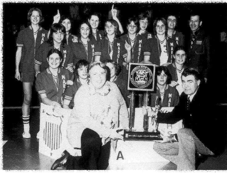
The Redettes realized their dream following a 68-41 win over Farmington Hills Mercy in the 1976 Class A Final. Marquette is still the only Upper Peninsula squad to win an MHSAA Class A basketball crown.