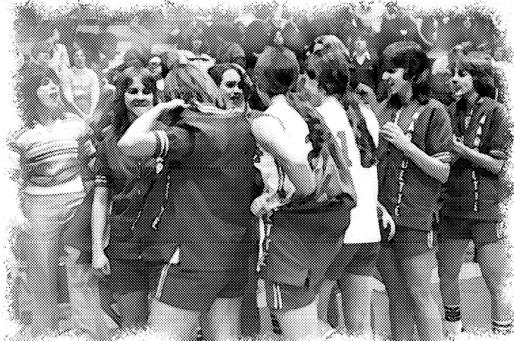
With another victory in the bag, the Redettes congratulate one another in a familiar postgame scene during the 1976 championship run.