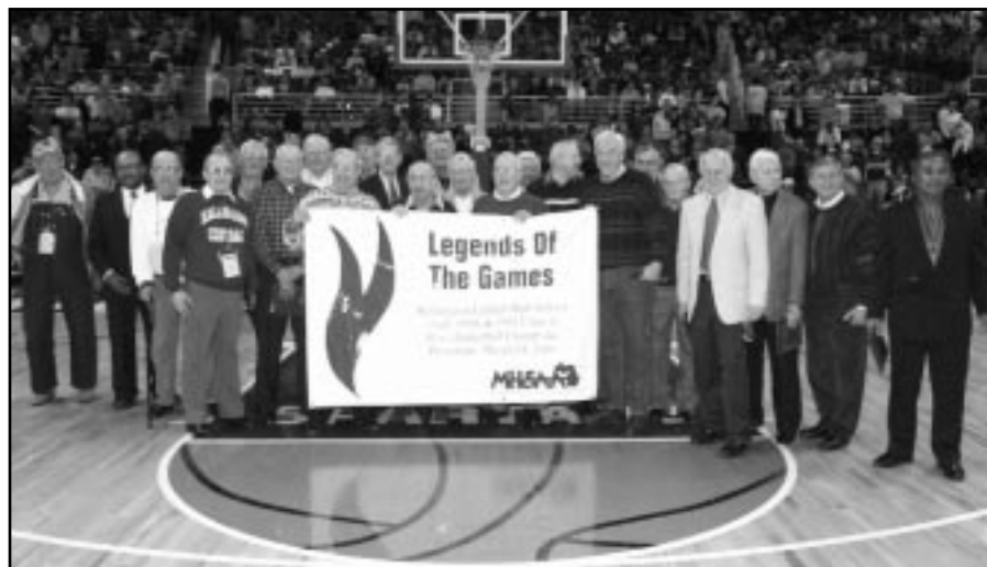
Kalamazoo Central — 1949, 1950, 1951 Boys Basketball Champions