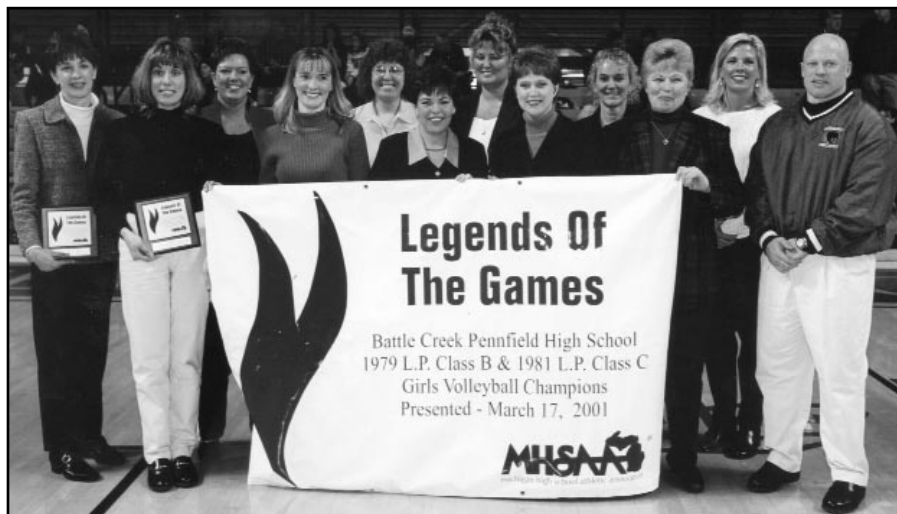
Battle Creek Pennfield — 1979, 1981 Girls Volleyball Champions

On March 24, at halftime of the Class A Boys Basketball Final game at East Lansing, the 1949, 1950 and 1951 Class A championship teams from Kalamazoo Central were honored.