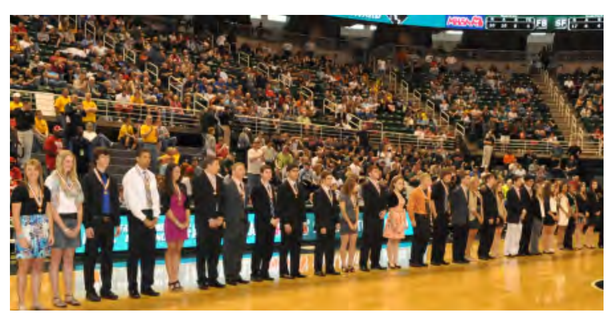
The annual scholar-athlete ceremony is one of the highlights of the winter season. More information about the awards may be obtained by contacting your local school principal, athletic director or guidance counselor. The online application form can be found at MHSAA.com/scholarship.

The 32 scholarship recipients will be recognized at the MHSAA Boys Basketball Finals at the Breslin Student Events Center in East Lansing in March.