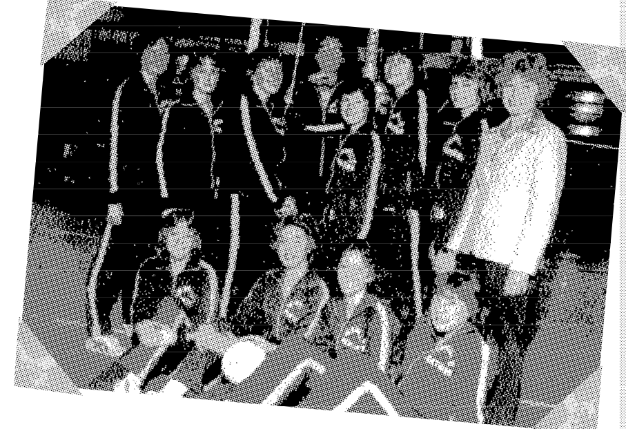
1979 MHSAA Class B Champs