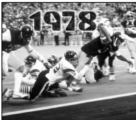
Falls Forest Park in the 1978 Class D tilt.