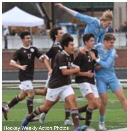
Hockey Weekly Action Photos